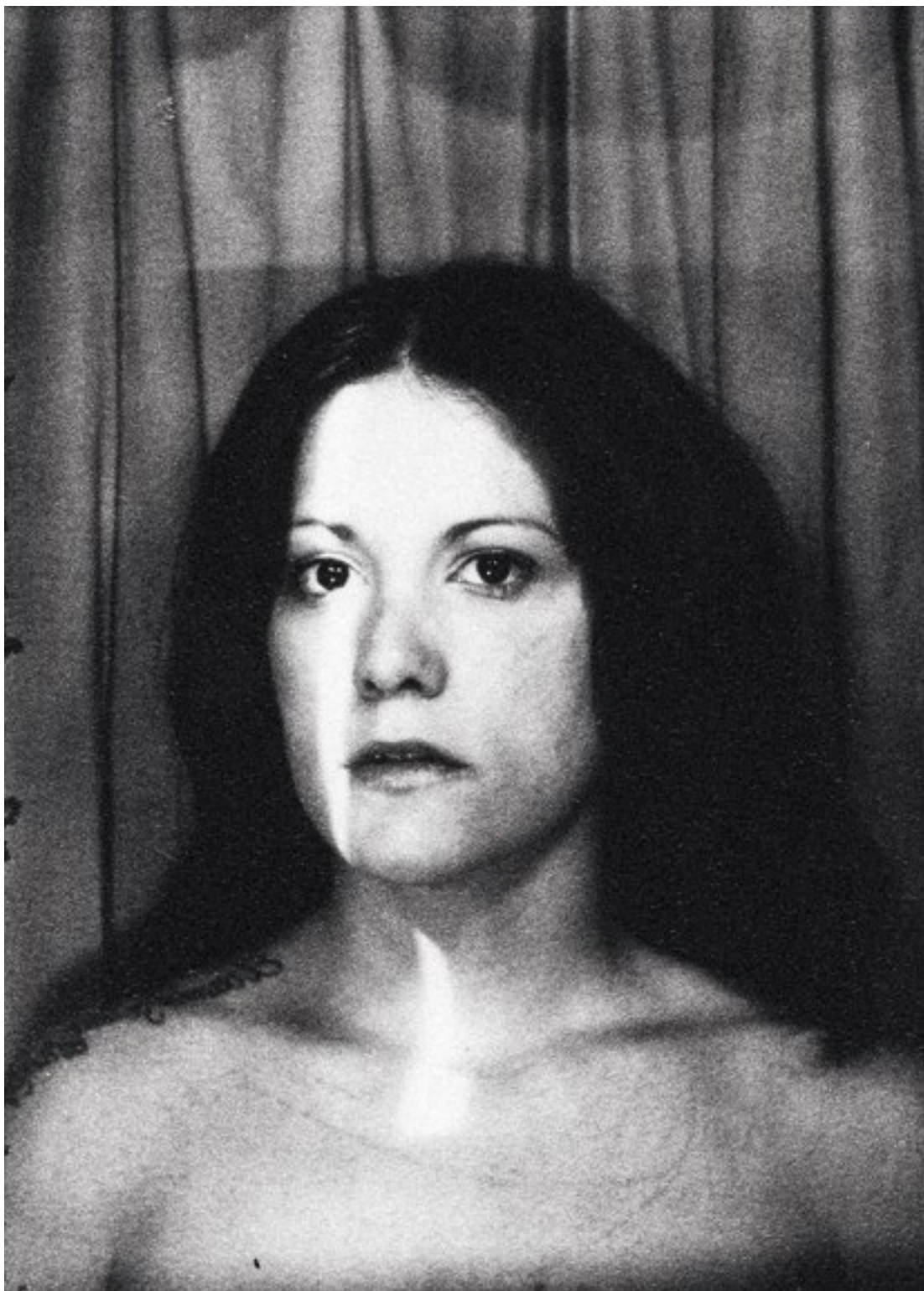
Self-portrait, from the project »The Swallows Return«, photo booth, Florence, taken in Photo II in the spring of 2015