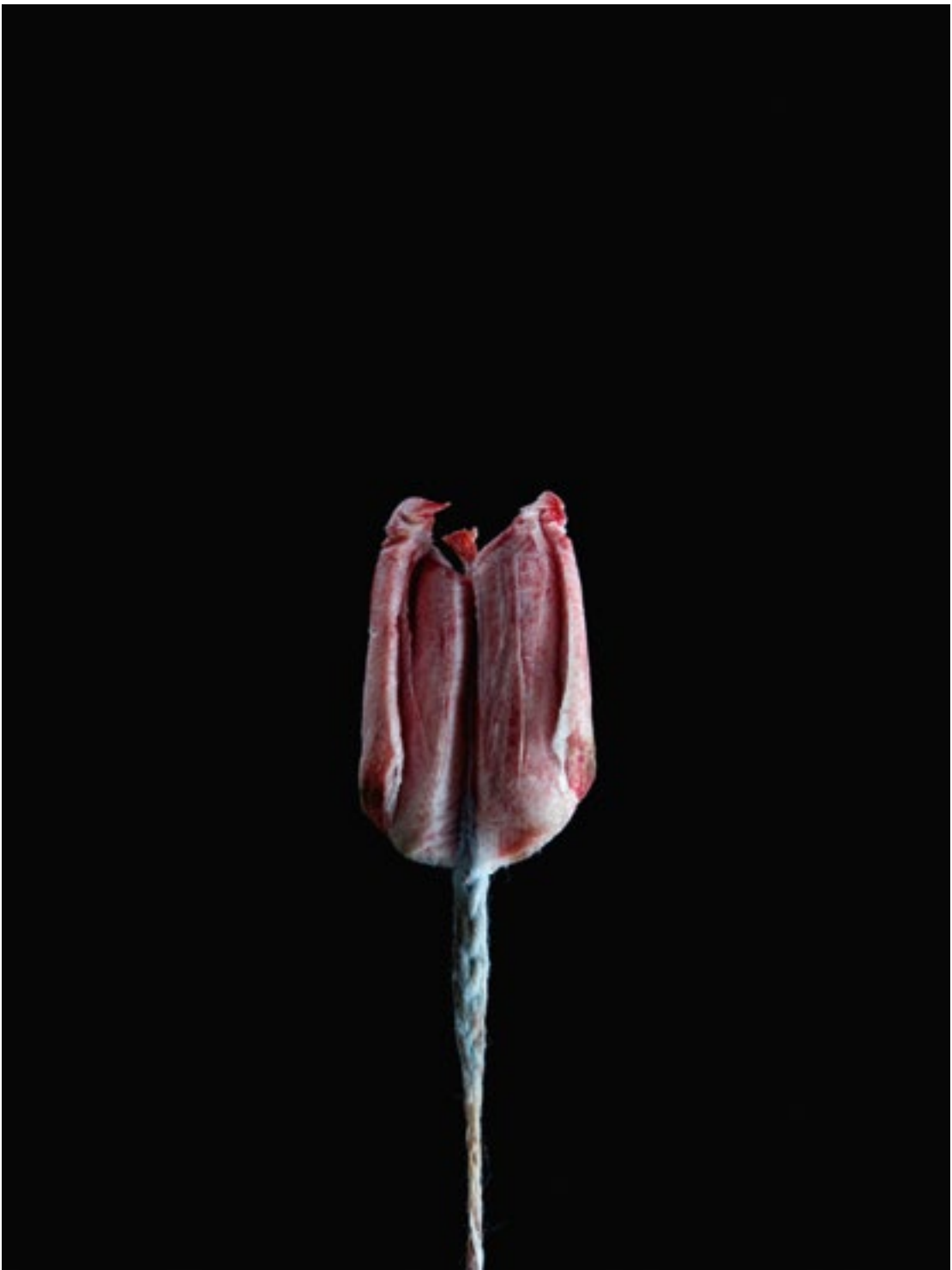
From the project »Semper Augustus«