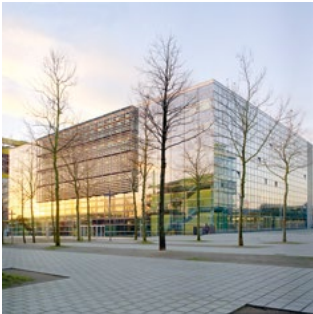
University of Applied Sciences and Arts Hanover, Expo Plaza 2, Faculty III