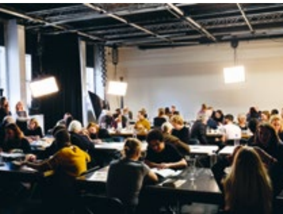
Students have their portfolios reviewed by professionals from the photography industry.

they usually work on several projects currently. We pay close attention to the ways students develop their initial ideas which ultimately result in a series, complete with all the accompanying product activities. Another characteristic is our emphasis on the development of intellectual and visual qualities . We ask students to approach their subjects with curiosity, an open mind, and then to investigate them thoroughly. This requires an interest in the content, background and diverse ways of representing a subject. Our students learn not only from their lecturers, but also from their peers. The educational process is dominated by a commitment to continuous effort in research, authenticity, dedication and professionalism . It is supported by a programme of electives and guest lectures from national and international professionals. Expertise from other disciplines is employed when necessary, allowing students to develop strategies for presenting their work optimally and in suitable contexts.