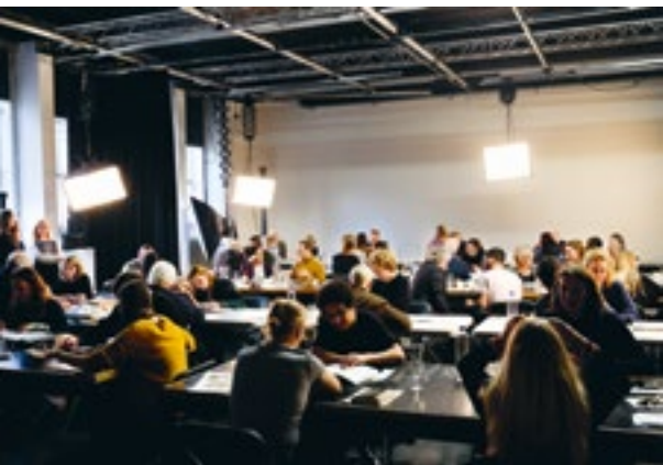
Students have their portfolios reviewed by professionals from the photography industry.

they usually work on several projects concurrently. We pay close attention to the ways students develop their initial ideas, which ultimately result in a series, complete with all the accompanying production activities. Another characteristic is our emphasis on the development of intellectual and visual qualities . We ask students to approach their subjects with curiosity and an open mind, and then to investigate them thoroughly. This requires an interest in the content, background and diverse ways of representing a subject. Our students learn not only from their lecturers, but also from their peers. The educational process is dominated by a commitment to continuous effort in research, authenticity, depth and professionalism . It is supported by a programme of electives and guest lectures from national and international professionals. Expertise from other disciplines is employed when necessary, allowing students to develop strategies for presenting their work optimally and in suitable contexts.