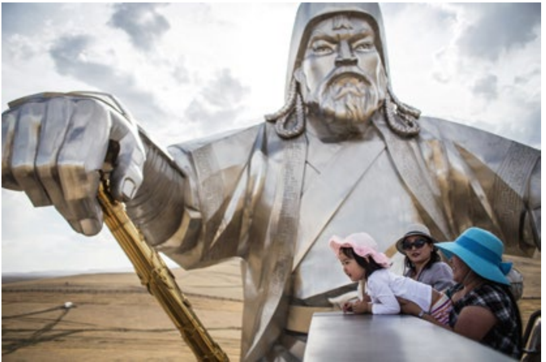
Ulaanbaatar, Mongolia