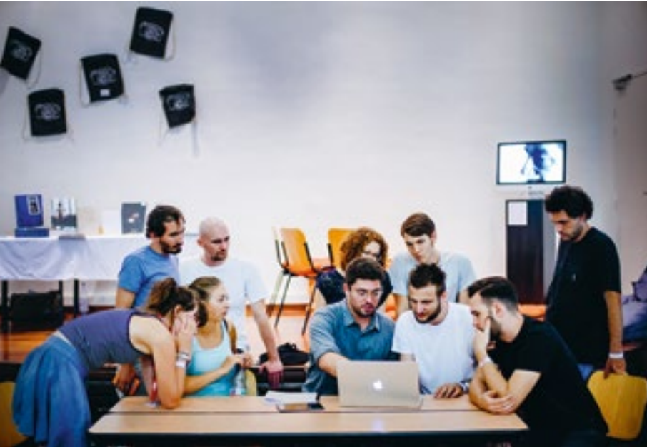
Portfolio review with students from the Photojournalism and Documentary Photography course at the University of Applied Sciences and Arts Hanover at the Visa pour l'Image festival. France, Perpignan, 2016

► Is there something you missed in your own photographic education that you would like to do differently as a teacher? — I was lucky to go to a fine arts school in Toronto and was practically the only photojournalist in the photography programme there. My professors gave us a lot of freedom to explore and create, but this left many students in my programme quite lost and without a clear direction. I had known from the beginning I wanted to become a photojournalist or war photographer, and this allowed me to find my own path without being influenced by what the school or my peers were doing. I made sure that I would take as much in as possible and the material seemed endless there. I had art history, photo history, philosophy, practical and theoretical classes and I must have spent hours and hours looking at books in the library. I would like to try and balance both the freedom to explore and the guidance to assist photojournalists when they are not sure what path they are comfortable with.