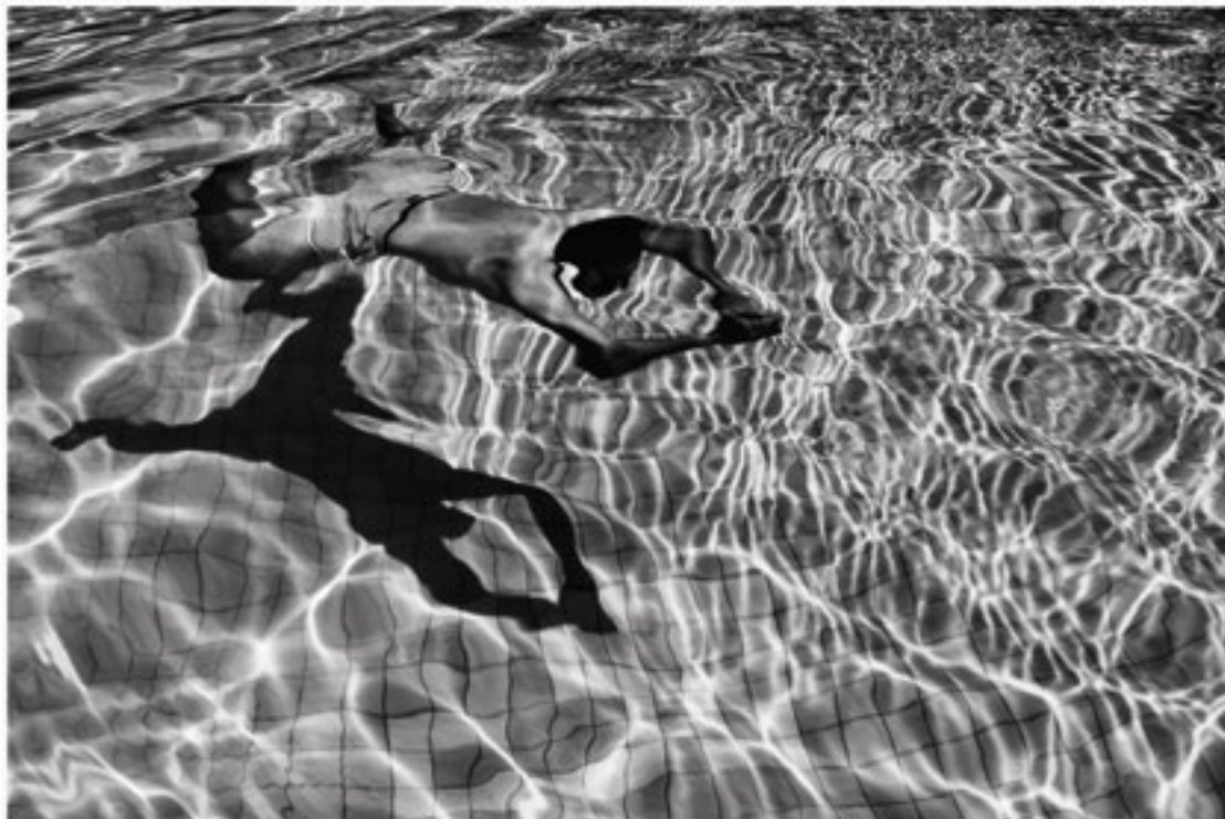
»Fermata 2«, 2016 © Eileen W. Cho