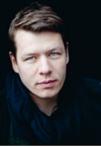
Mads Nissen © Morten Rode