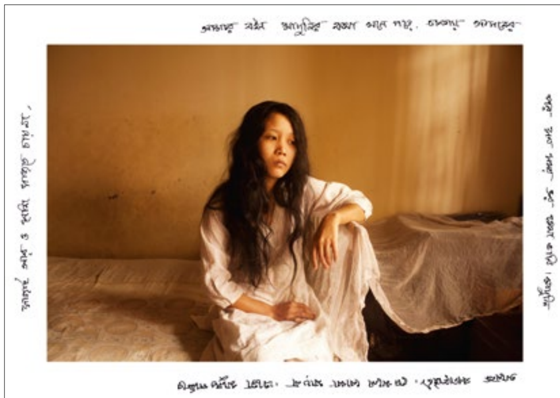
From the project »Dear Love«, Shurpa, Dhaka, 2011