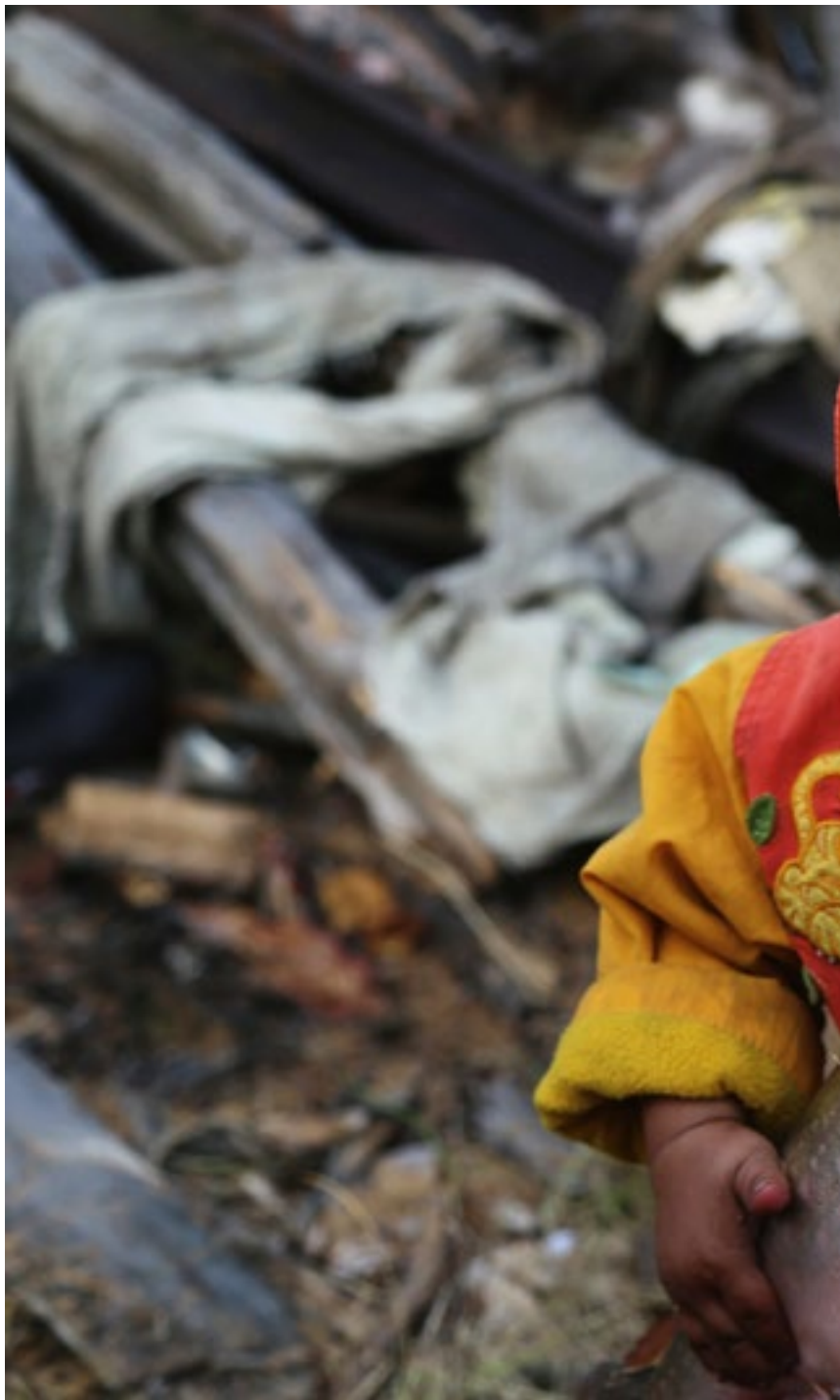
Yakutiya © Nina Sleptsova