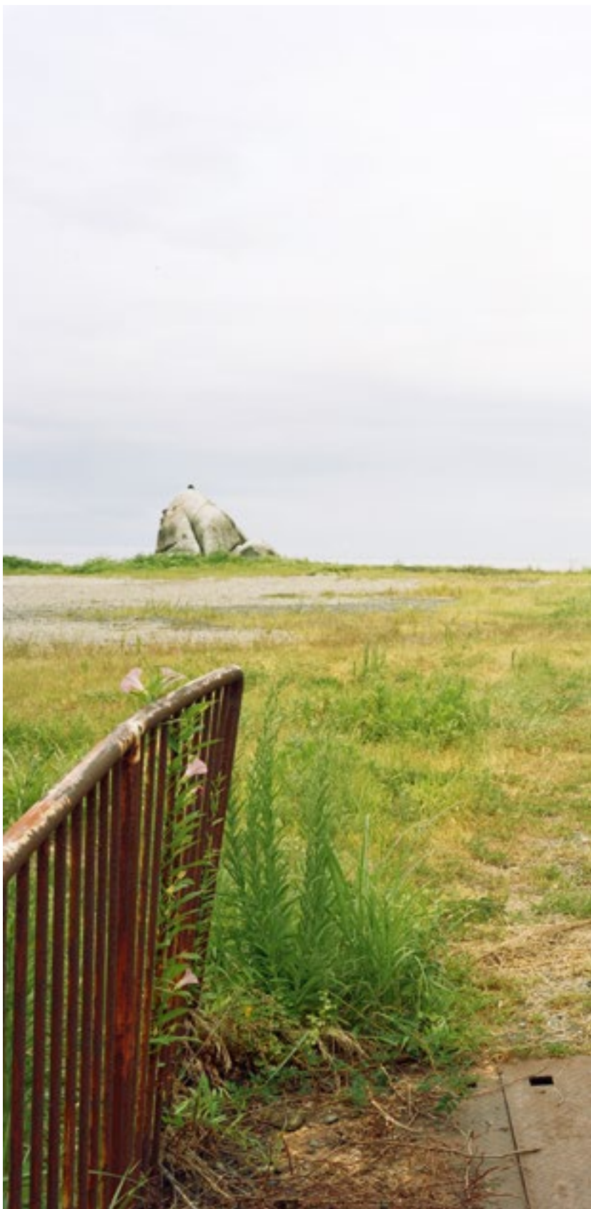
House by the sea, from the project »アメリカ (Amerika)«, 2016 © Max Ernst Stockburger