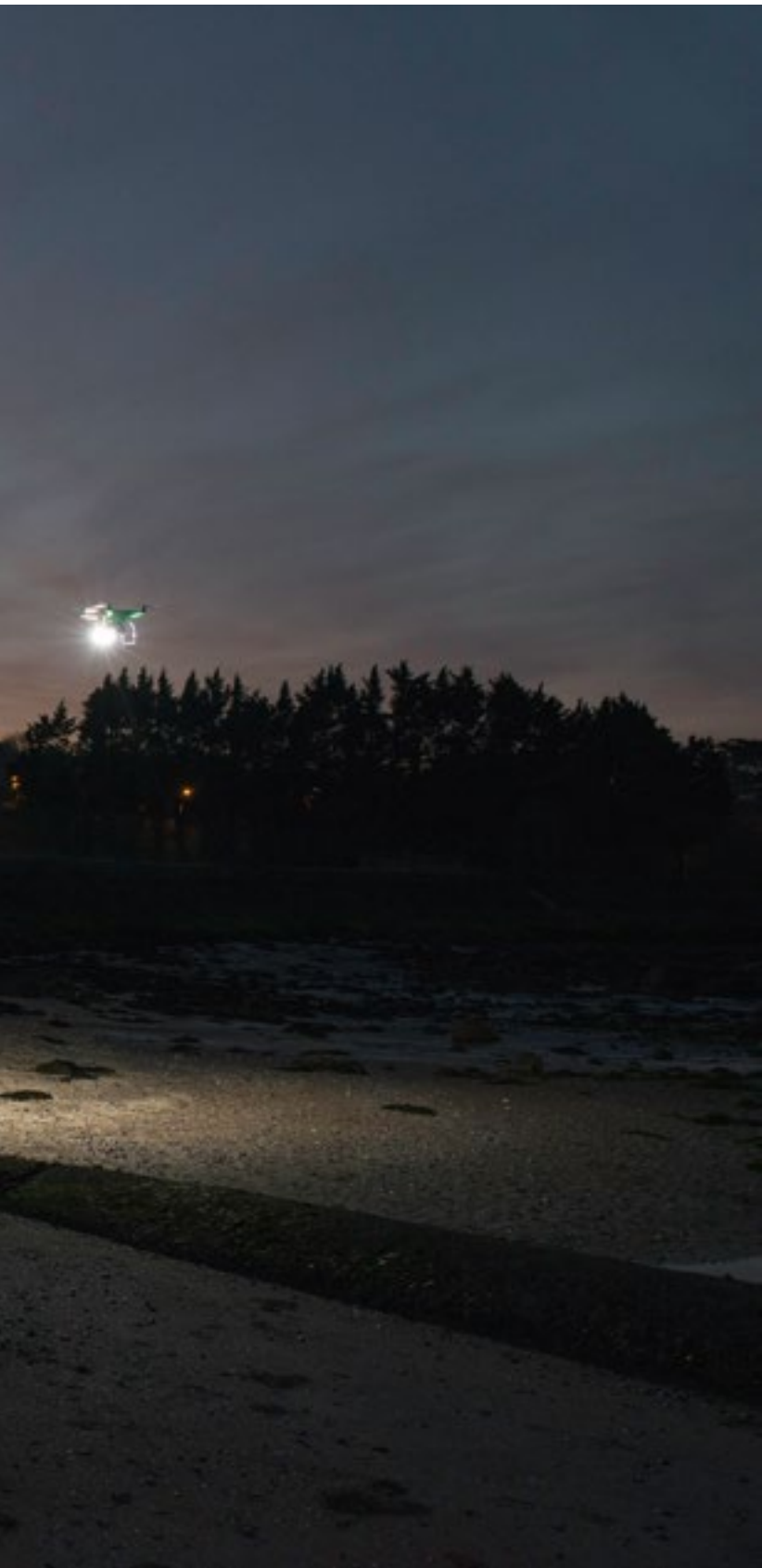
From the project »Woodburn«