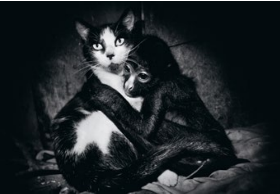
A monkey hugs a domestic cat. Ecuador, Parque Nacional Yasuní